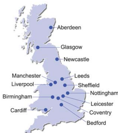
Brandeaux's student accommodation sites.