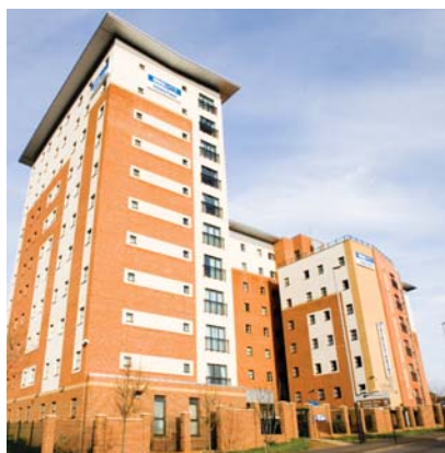
An example of student accommodation at Liberty Point, Coventry.