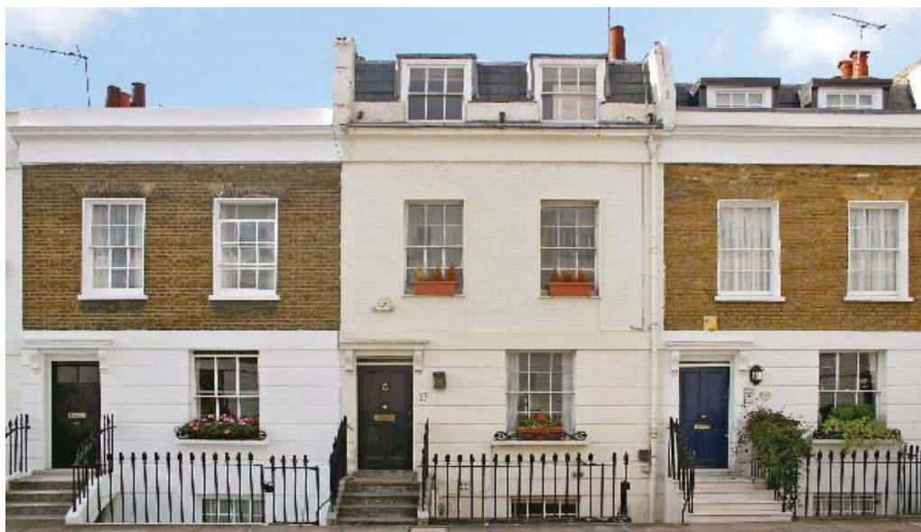
An example of a ground rent investment with significant reversionary value.

The Fund invests in a portfolio of over 20,000 residential ground rent and reversionary properties located throughout the UK, with geographic emphasis on Central London. There is a concentration of value in the affluent London locations of Chelsea, Knightsbridge, Kensington and Mayfair. The properties are focused on freeholds producing an increasing value towards reversion date which provides the backbone of the low volatility and consistent performance.